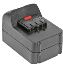
169 020 / 169 021