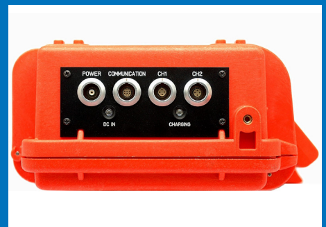
Rugged Waterproof Case